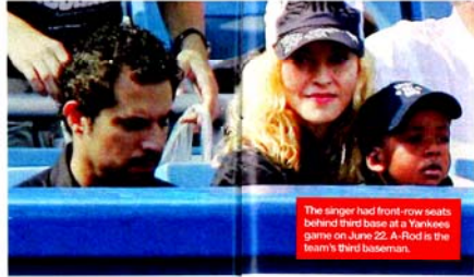
The singer had front-row seats behind third base at a Yankees game on June 22. A-Rod is the team's third baseman.