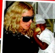
Madonna and her kids visited NYC's Kabbalah Centre the weekend of June 28. Rocco wore a Yankees cap on one trip.

With the rumored divorce looming comes the sticky question over custody. Lourdes, 11, is Madonna's child from her relationship with Carlos Leon, Rocco, 7, is the Ritchies' biological son, and David, 2, was adopted by the couple from Malawi. "Unless Madonna agrees to let Guy visit with Lourdes, he will likely be treated as a legal stranger to the child," family law attorney